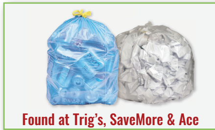
Found at Trig's, SaveMore & Ace

Leave loose if you have a yellow lid cart