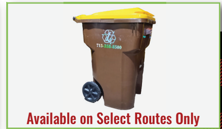
Available on Select Routes Only